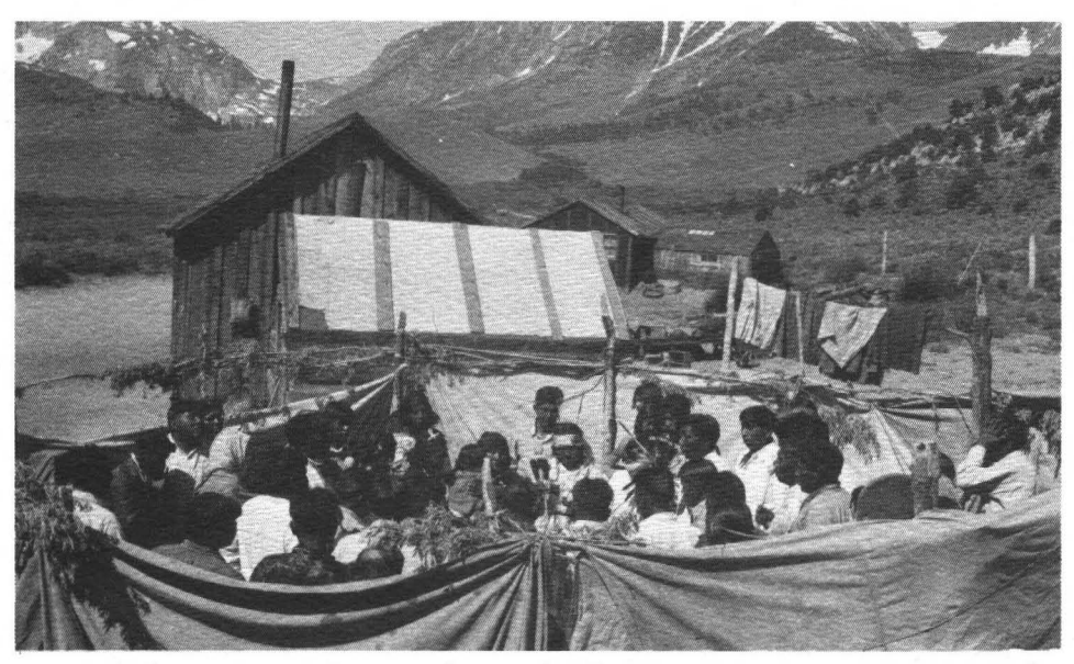
Around the Peyote altar at the end of a Peyote meeting, Mono Lake, 1938. After the midnight recess, all members took their individual fans and gourd rattles and shook them in unison with the leader of a hymn.