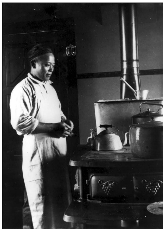
A Chinese cook in the kitchen of the Dangberg Home Ranch, ca. 1898.